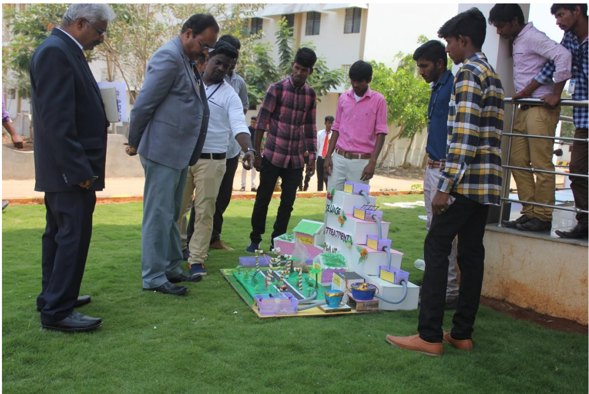
Model Making "Sewage treatment plant" III year civil Students