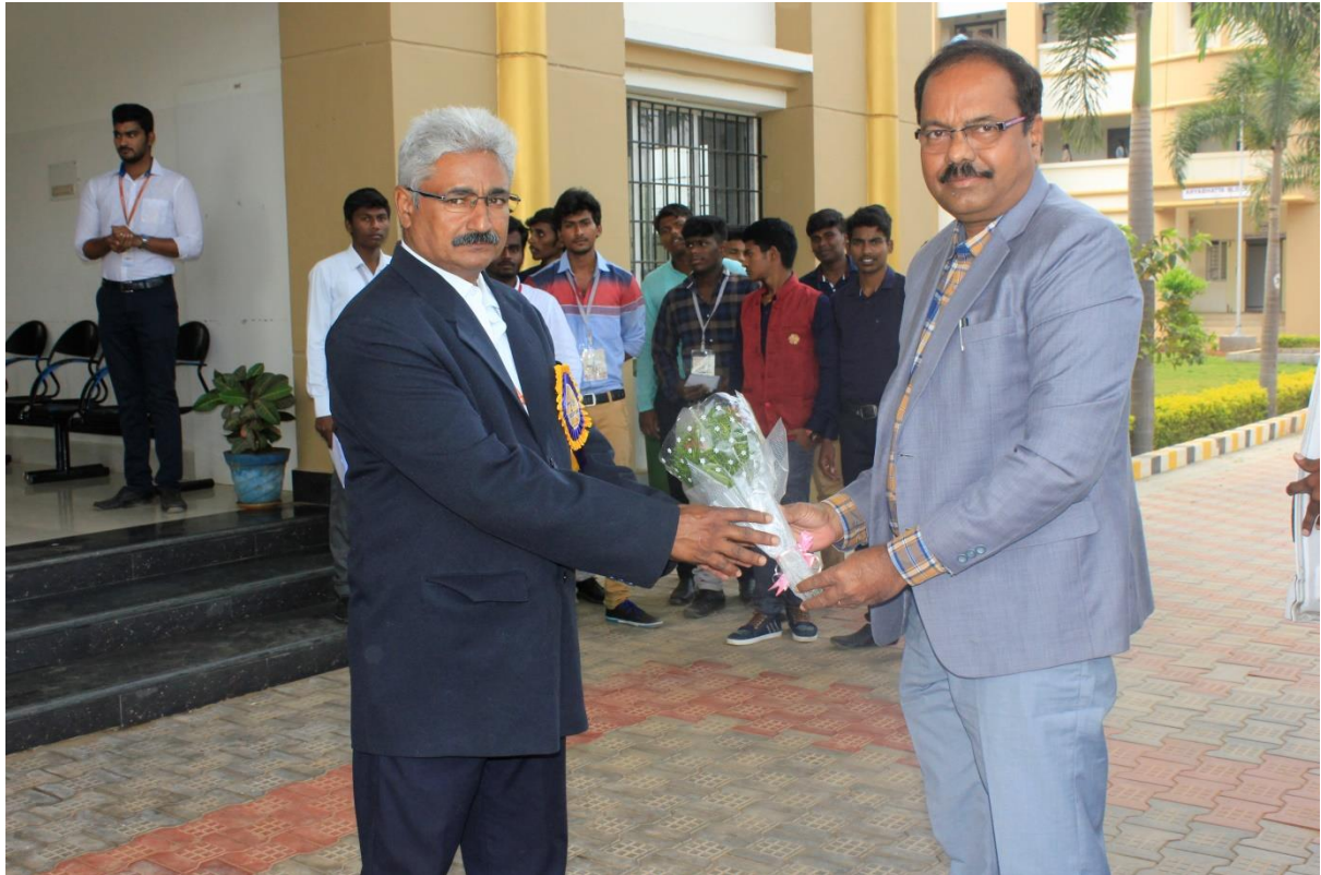
Receiving the Chief guest for the morning function by the Head of the Department